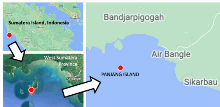
Figure 1. Research Site Map.

Material and Method. This research was conducted in Panjang Island, Aia Bangih, West Pasaman Regency, West Sumatra Province, Indonesia (Figure 1). The research method used descriptive methods, communication, and data visualization to translate raw data into useful for achieving objectives (Loeb et al 2017). The field survey used a questionnaire (Appendix 1) and it was conducted in June-December 2020.